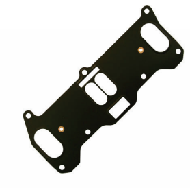
ENGINE GASKET SET